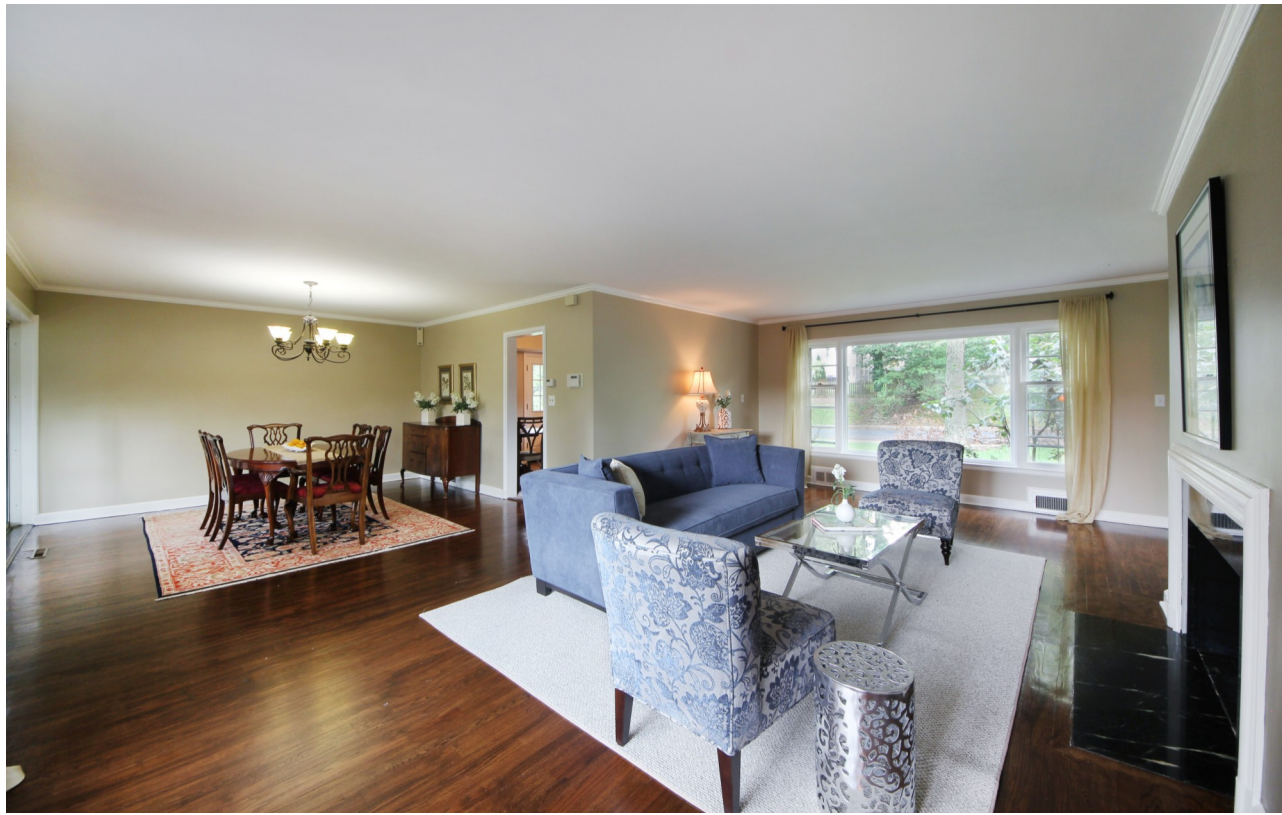
Spacious and open rooms coupled with timeless appeal come together with recent updates that showcase this sprawling ranch.