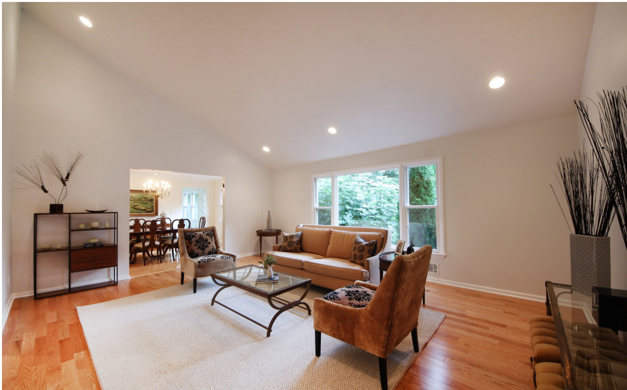
Spacious and open rooms coupled with timeless appeal come together with recent updates that showcase this sprawling ranch.