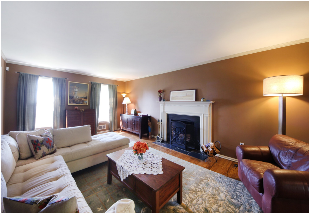
Stunning classic Colonial with impeccable style both inside and out

Picture perfect classic Colonial positioned perfectly to expose amazing lighting and views on quiet street only blocks from Burnett Hill Elementary school. Every inch of this home has been updated with high end finishes, custom details throughout and an open, flowing floor plan with plenty of room to entertain both inside and out.