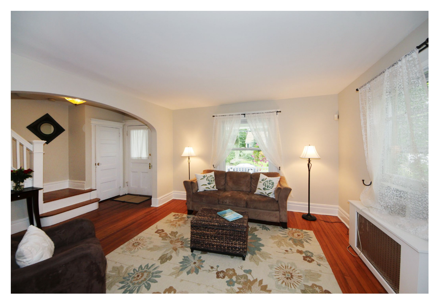
Opportunity awaits at this delightful period colonial. Perfectly positioned in the Wyoming section, this is a unique chance to take full advantage of a great value and all Millburn has to offer.

Built in 1923, four finished levels include a modern kitchen and baths, gleaming wood floors, large windows and an easy flow made for entertaining and daily living. As mature landscaping artfully frames the exterior, the covered front porch extends a warm welcome. Just imagine lazy afternoons and cool beverages, as friends and loved ones gather on this covered porch. Step inside and you are greeted by a side-hall foyer, where a guest closet accepts your belongings and an elegant turned staircase leads the way to the second level. A wide entry reveals the living room, where guests are comfortably seated. Adjoining the living room is the formal dining