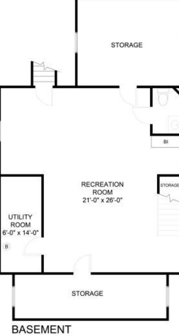
NOT TO SCALE - This floor plan is provided for illustration purposes only. Room positions and dimensions are approximate and should be independently measured for accuracy