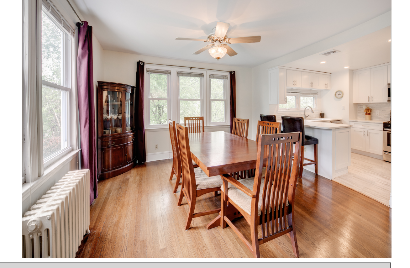
Welcome to 3 Florham Avenue! This picture perfect 5 Bedroom, 3 Bath colonial in sought after Florham Park has it all with close proximity to New York City transportation, Trader Joes, Starbucks, restaurants and just minutes away to Livingston and Short Hills Malls.

Walk up the charming brick walkway flanked by meticulous landscaping and leading to an elegant covered entry. Enter this classic home and you'll be drawn to the sundrenched Living Room featuring gleaming hardwood floors, oversized windows and a stately fireplace. Flow into the bright and airy Dining Room perfect for entertaining family and friends. The newly renovated Gourmet Chef's Kitchen is any cook's dream with crisp white shaker style cabinetry, quartz countertops, stainless appliances and a breakfast bar for two. Curl up with a book or enjoy movie night in the sun drenched Family Room. Thanks to copious windows, the room is bathed in sunlight providing a dazzling view of the sumptuous backyard and gorgeous pool. A brand new heated Two Car Garage, a side entry area off of the garage and a tasteful Full Bath round out the First Level.