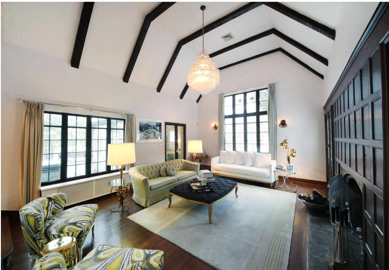
Period details and timeless appeal come together with thoughtful updates in this one-of-a-kind Tudor

This Short Hills model Tudor is sure to impress any buyer! Located on a spacious corner lot in the sought after Knollwood section, this home boasts curb appeal, location (blocks to Millburn Middle School, train station and downtown) and both style and charm. Pull right into the circular driveway and walk up the front walkway and enter through the period correct arced entrance door surrounded by carved limestone and into the foyer where gleaming hardwood floors flow effortlessly under toe from one room to the next. Step down into the Living room where elegance and grandeur are apparent in every detail from the vaulted beam ceiling, leaded glass windows and doors to the wood paneled fireplace and limestone surround; creating a true focal point and a room sure to be the center of all your entertaining.