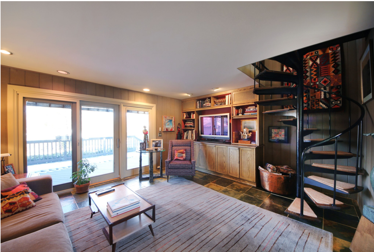
Contemporary details and timeless appeal come together with thoughtful updates in this one-of-a-kind home

This Livingston contemporary style home is sure to impress any buyer! Located on a spacious lot, this home boasts curb appeal, location (blocks to Heritage Middle School, mall and downtown) and custom finishes.