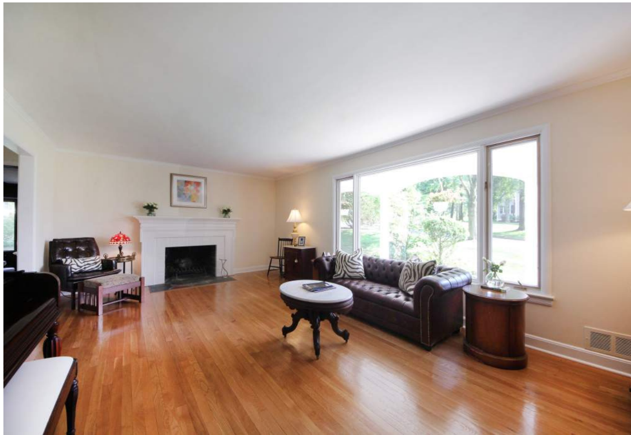
Spacious split level with endless possibilities both inside and out

The possibilities are endless in this spacious split level resting on .35 acres in the Poets section of Short Hills, only a few minutes from Hartshorn Elementary. Loaded with curb appeal, attention to detail is evident from the moment this fine home comes into view. The open concept floor plan provides spaces equally suited to entertaining and comfortable daily living—a wonderful place to call home.