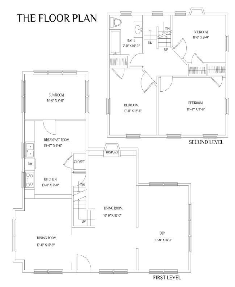
NOT TO SCALE - This floor plan is provided for illustration purposes only. Room positions and dimensions are approximate and should be independently measured for accuracy.