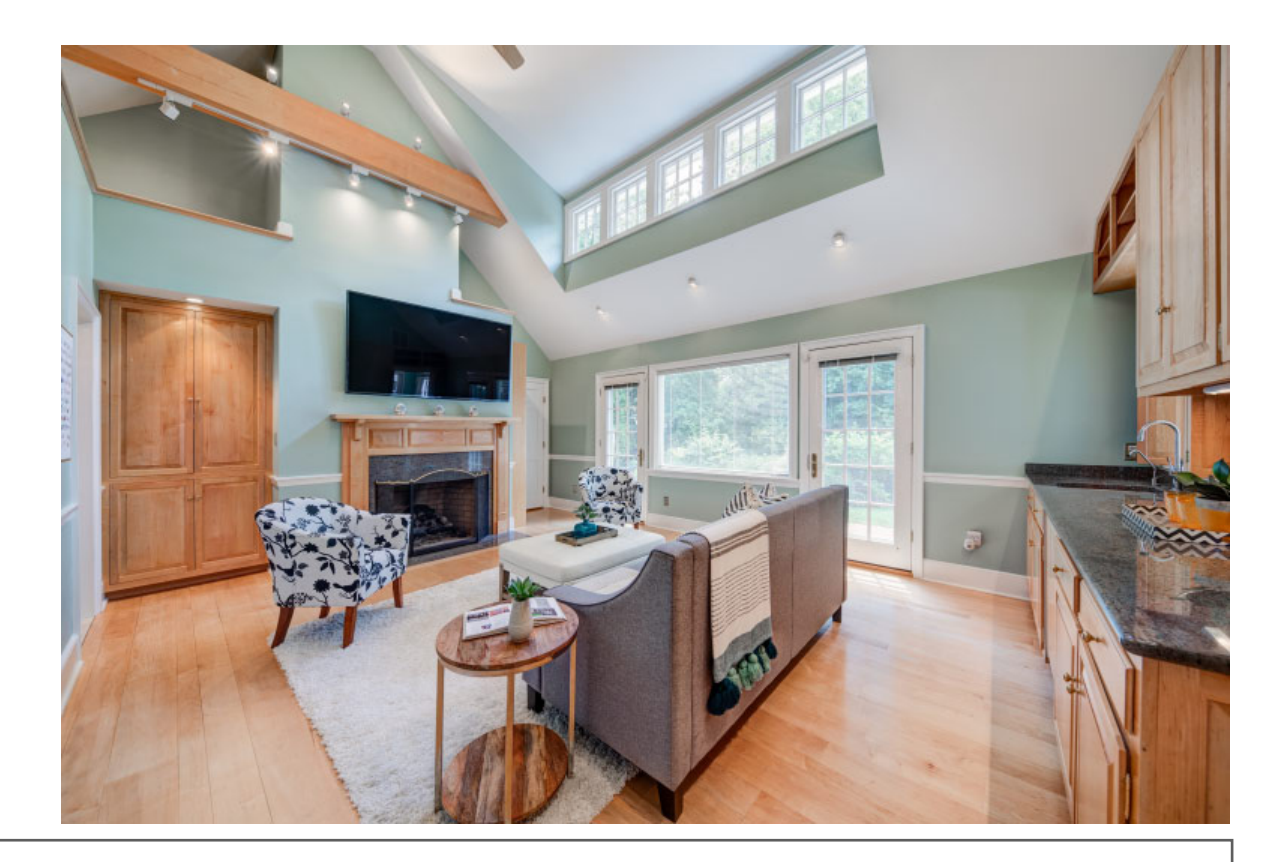
Welcome to 72 Blackburn Place! This picture perfect 4 Bedroom, 4 Bathroom custom home in the sought after Franklin Elementary School District (just one block to Franklin School!) and on one of Summit's best blocks has it all with close proximity to New York City, Midtown Direct train and Summit's excellent restaurants and shopping.