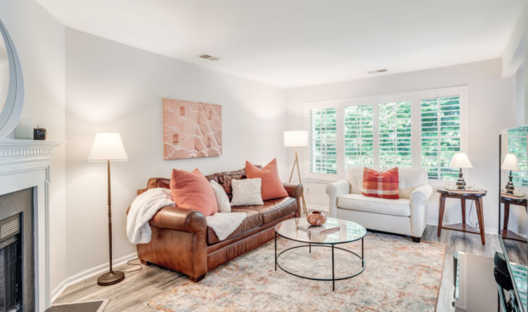
Look no further! Beautiful townhome in Chatham's prestigious Sutton Woods development! This spacious, freshly painted, and recently updated 2 Bedroom, 2 Bath townhome offers an open and airy floor plan, a dazzling Primary Suite, and backs up to an idyllic wooded area for privacy. Sutton Wood's outstanding lifestyle amenities include a swimming pool, tennis and paddle tennis making this is the perfect place to call home.

As you enter, a newly carpeted staircase takes you to the Main Level where rooms meld seamlessly together and light pours in. The Entry Landing includes a spacious Walk In Coat/Storage Closet and a convenient Laundry Room. Move easily into the light and bright Living Room with new laminate floors and a wood burning fireplace for cozy nights. The Kitchen will impress with bright new light fixtures, plenty of storage, granite countertops, stainless appliances and a Breakfast Bar where you can enjoy a cup of coffee or a meal. The Kitchen opens to the lovely Dining Area with new laminate floors and spectacular views of the natural setting beyond. Off of the Dining Room, don't miss your own Private Balcony where you are thoroughly encased by nature.