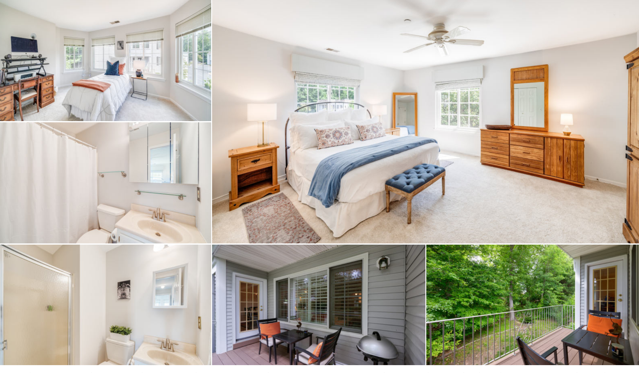
Ready to retire for the evening, flow down to the Primary Suite that offers immense space and privacy. This suite has brand new carpeting and two Closets (1 Walk In) so that everything will be neatly tucked away. A well-appointed Full Bath rounds out the Primary Suite. Down the hall, you will find glorious Bedroom 2 with brand new carpeting and an elegant bay of windows where the light pours in. A tasteful Full Bath rounds out this area.

And there's more! Downstairs, don't miss the enormous Bonus Room perfect as a Recreation or Media Room. A roomy Garage, with plenty of room for a car and storage, rounds out this level.