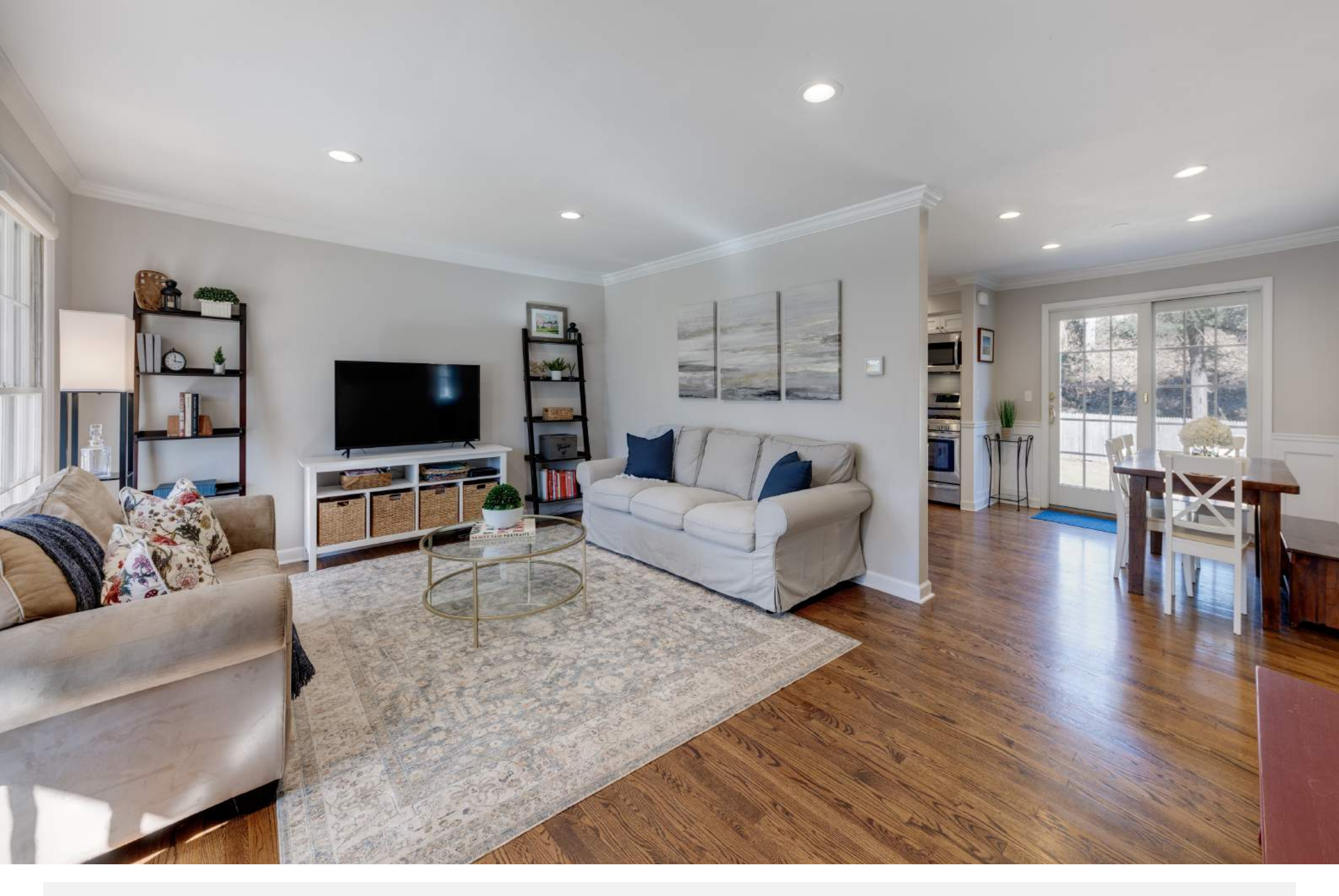
Welcome to 16 Woodland Road!

This picture perfect 4 Bedroom, 2 Bath Cape has it all. On a sought after block close to everything with incredible charm, an open and airy floor plan and on trend design/renovations, 16 Woodland is an absolute dream.