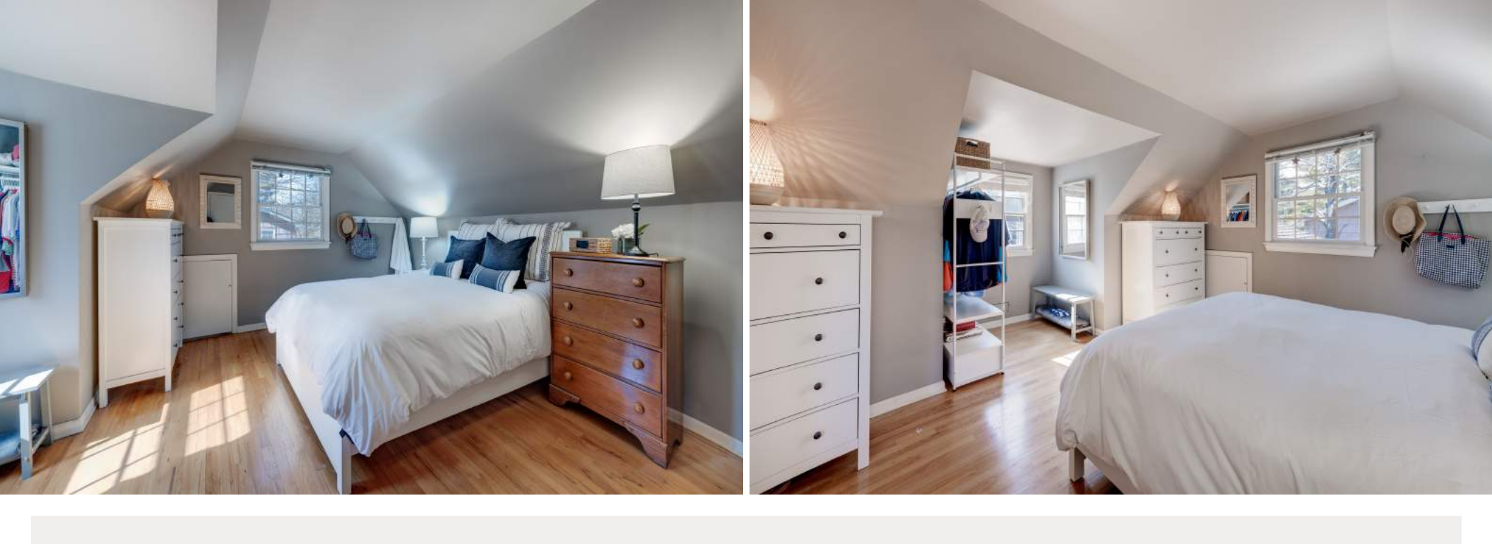
Take the elegant steps upstairs to find Bedrooms 1(Primary) and 2. The Primary Bedroom impresses with a cool gray hue, vaulted ceiling and plenty of sunlight. Bedroom 2 radiates with sunlight and soothing blue paint. A well-appointed Full Hall Bath rounds out the Second Level.