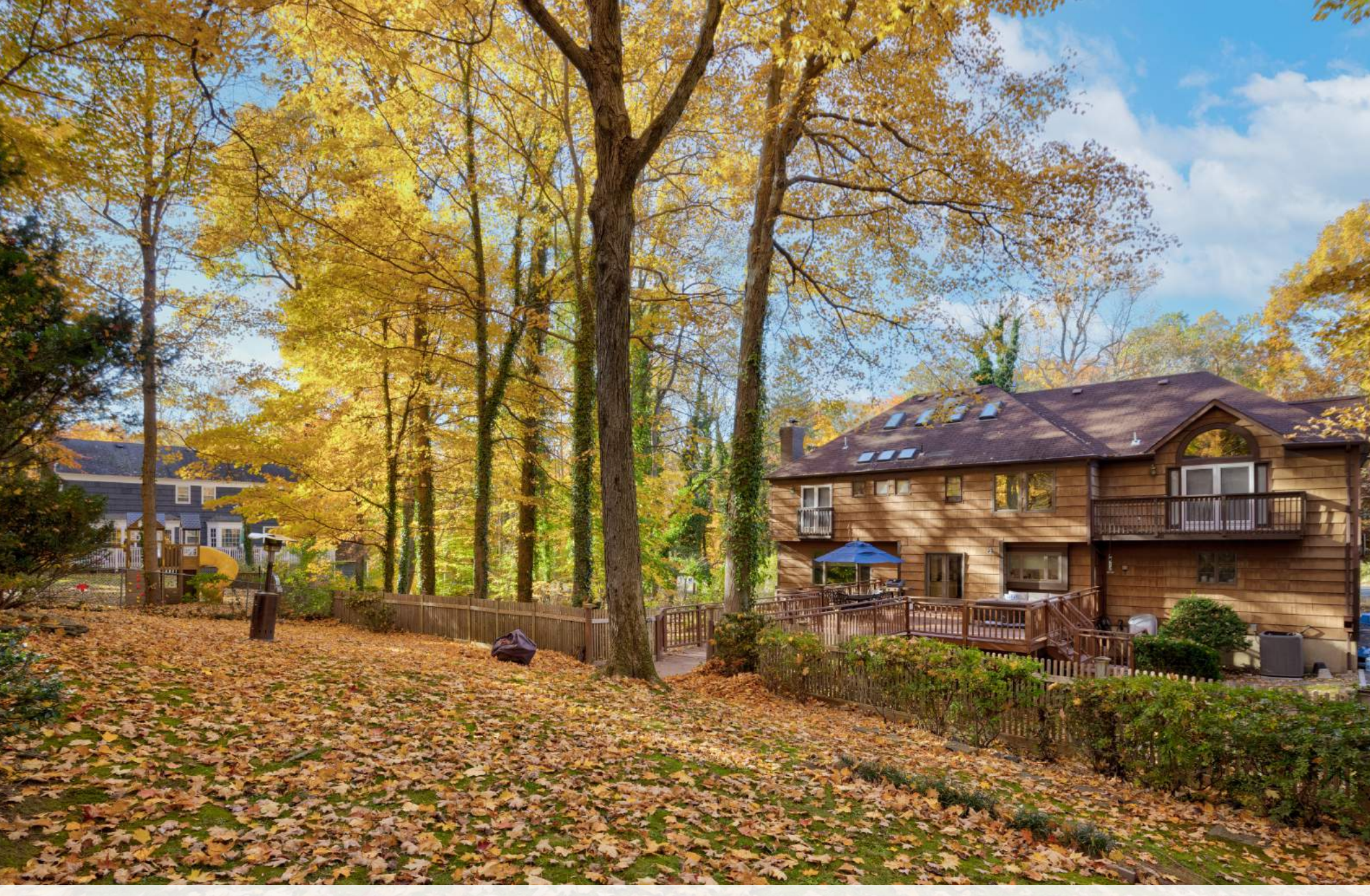
Welcome to 140 Mountain Avenue, an enchanting 4 bedroom, 3.1 Bath custom Tudor-style home on a sought-after block in the desirable Tall Oaks section of New Providence (with a Summit mailing address)! With an exceptional .5 acre lot and stellar natural views, this is the kind of home where you can feel like you are "away from it all" 365 days a year. Close to NYC train, Watchung Reservation (nature museum, horseback riding, hiking), top-notch New Providence schools (Salt Brook Elementary), Route 78, and recreation (community pool/parks), 140 Mountain Avenue is just waiting to be called home.