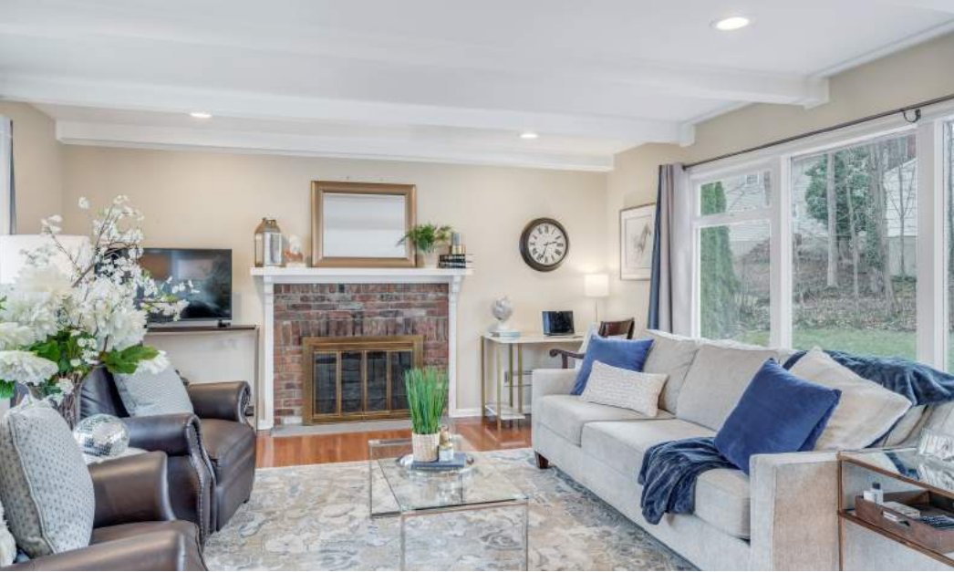
Welcome to 66 Wade Drive! This BRIGHT AND AIRY 4 Bedroom, 2 Bath home sits in Summit's Washington Elementary School District, a short distance to recreational pursuits at Tatlock Park, Route 24, Midtown Direct Train, and all downtown Summit has to offer. Don't blink, this charmer will not last!

As you arrive, take in this charming home sitting beautifully on a quiet cul de sac great for play. This home is open and airy, painted with neutral hues, and has a desirable open floorplan. Enter through an Entry Vestibule that leads to the front door and into the warm and welcoming Living Room. Admire the stunning beamed ceiling, brick fireplace, and windows galore so the sunlight pours in.