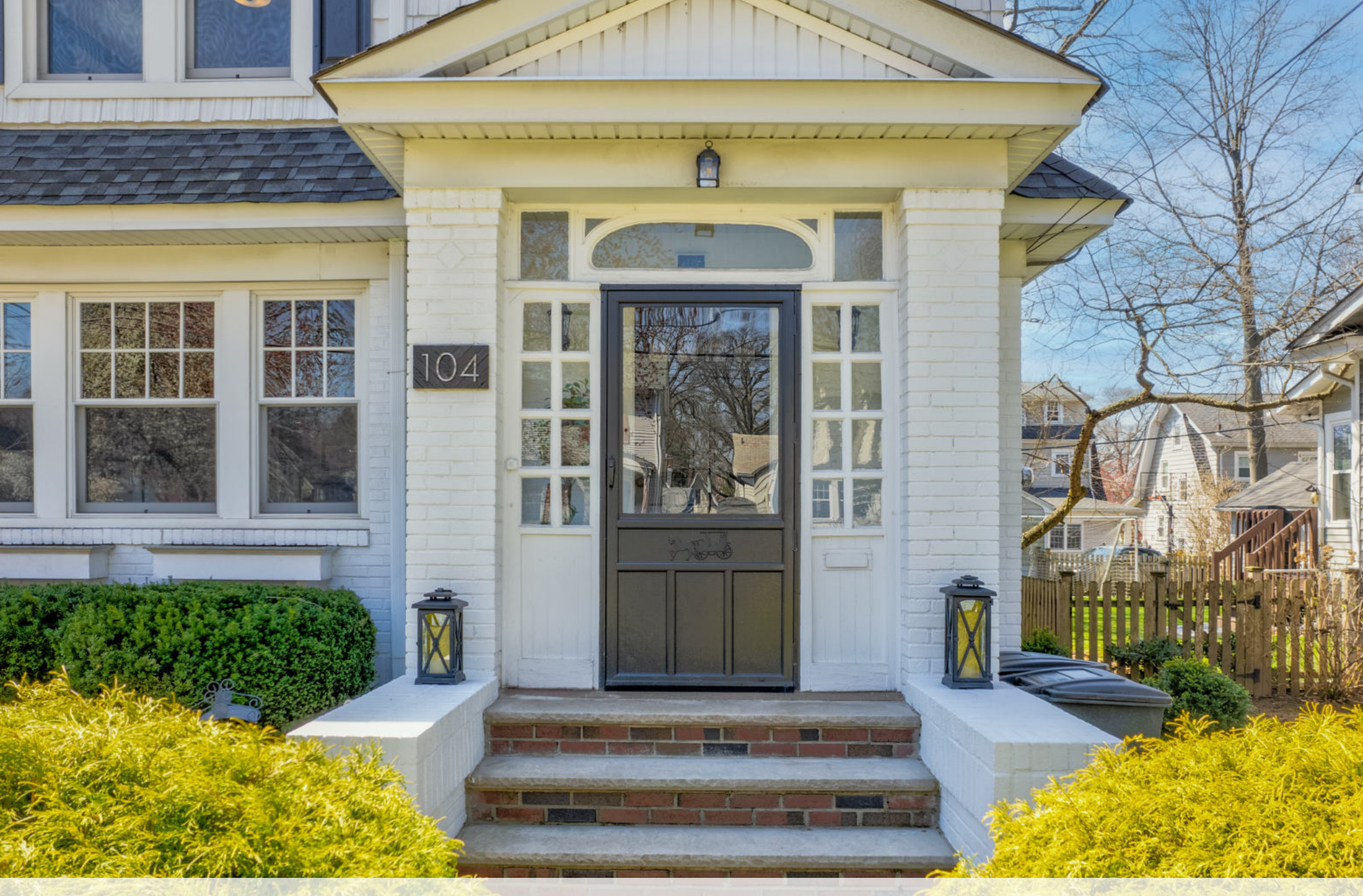
Welcome to 104 Oakland Road! This move-in ready 4 Bedroom, 1 Full and 1 Half Bath Side Hall Colonial in sought after Maplewood hits all the right notes. Located on a picturesque, sought-after block, this home has been stylishly renovated with care and attention to detail while staying true to its classic character. Close to top-notch schools, walking distance to Maplewood Village, and Maplecrest Park. Community Pool with four different pools is a three minute drive, and for NYC transportation the "Jitney" is two blocks away. This home impresses at every turn!