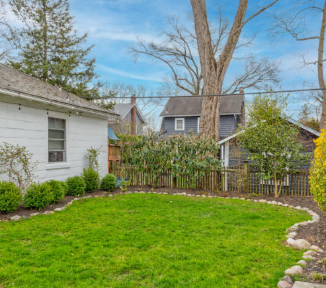
Prepare to be impressed with the renovated Chef's Kitchen featuring crisp white cabinets, granite countertops and stainless steel appliances. The Kitchen includes a dreamy Breakfast Room, and a tasteful Powder Room is conveniently located nearby. Outside, the charming backyard includes a Side Deck, spacious New Stone Patio and blooming perennials all providing the perfect backdrop for summer entertaining.