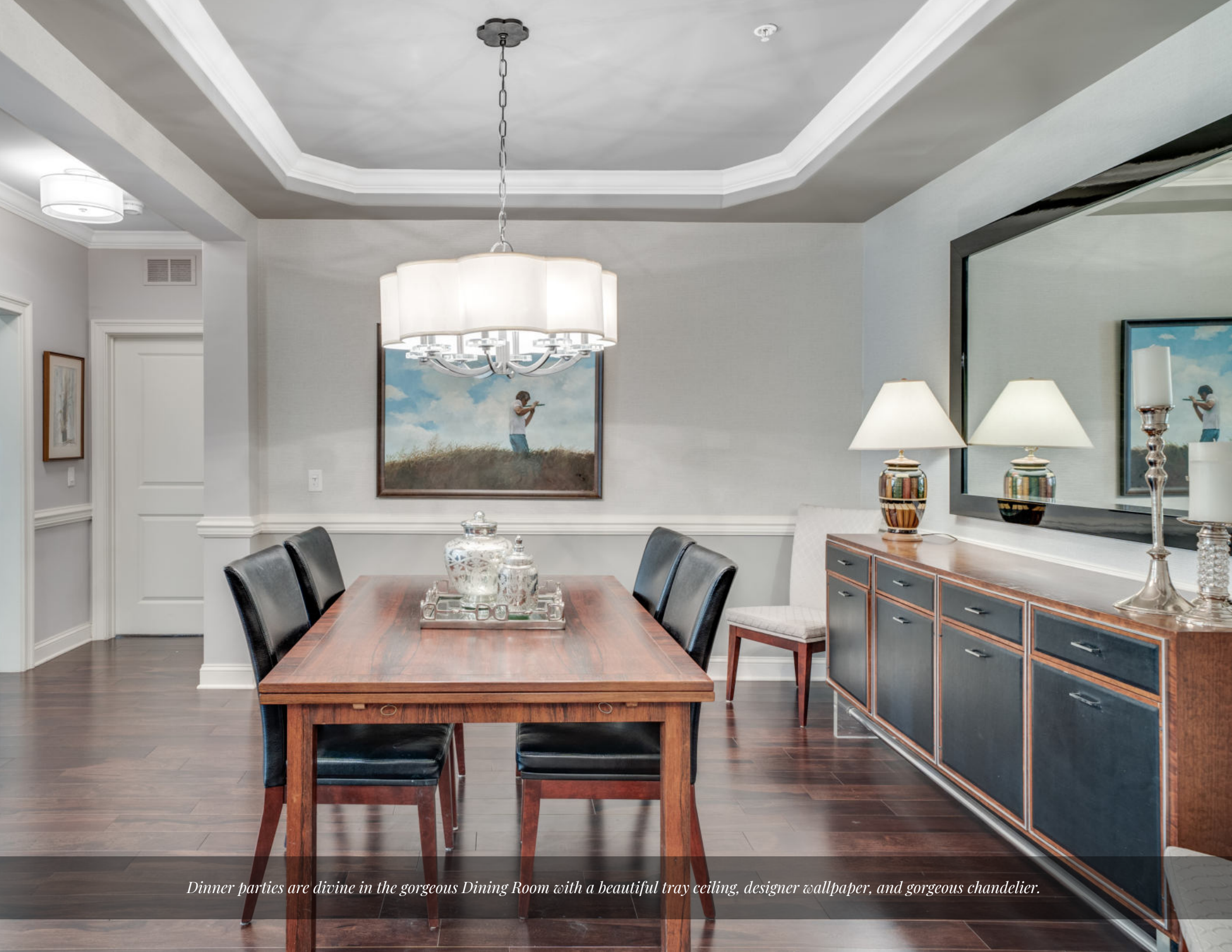
Dinner parties are divine in the gorgeous Dining Room with a beautiful tray ceiling, designer wallpaper, and gorgeous chandelier.