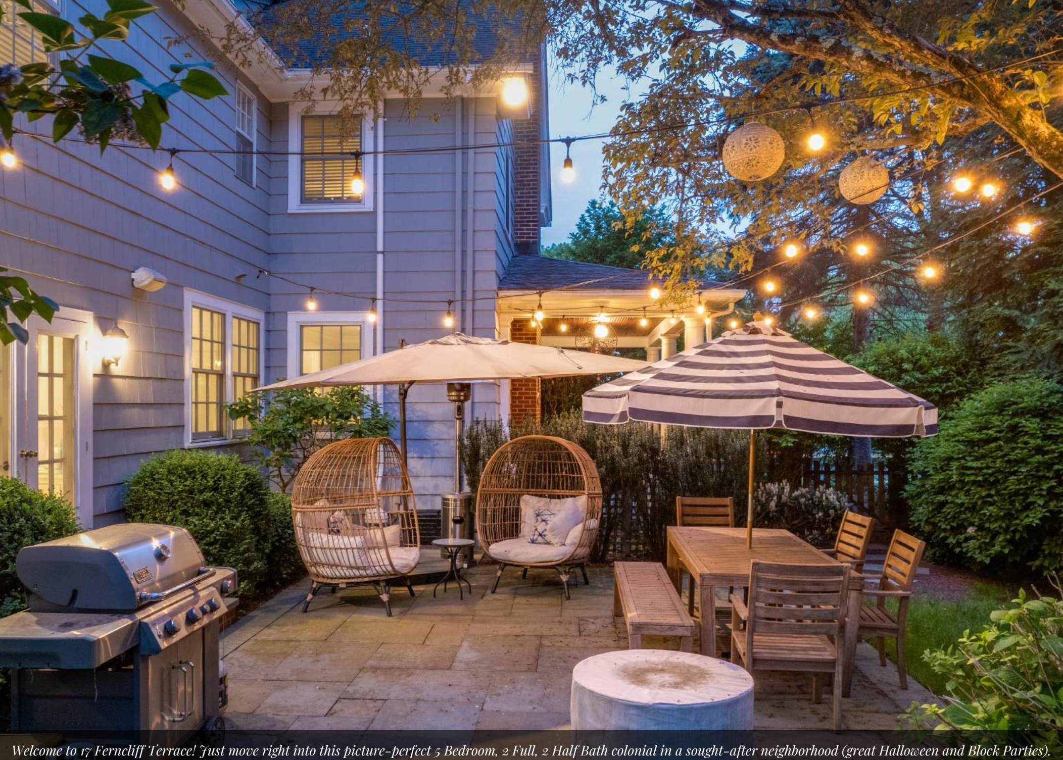
Welcome to 17 Ferncliff Terrace! Just move right into this picture-perfect 5 Bedroom, 2 Full, 2 Half Bath colonial in a sought-after neighborhood (great Halloween and Block Parties). With an exceptional location close to Glenwood School, downtown Millburn restaurants and shopping, Millburn High School (bus to MS), Short Hills Train Station, and Hartshorn Arboretum, 17 Ferncliff is just waiting to be called home.