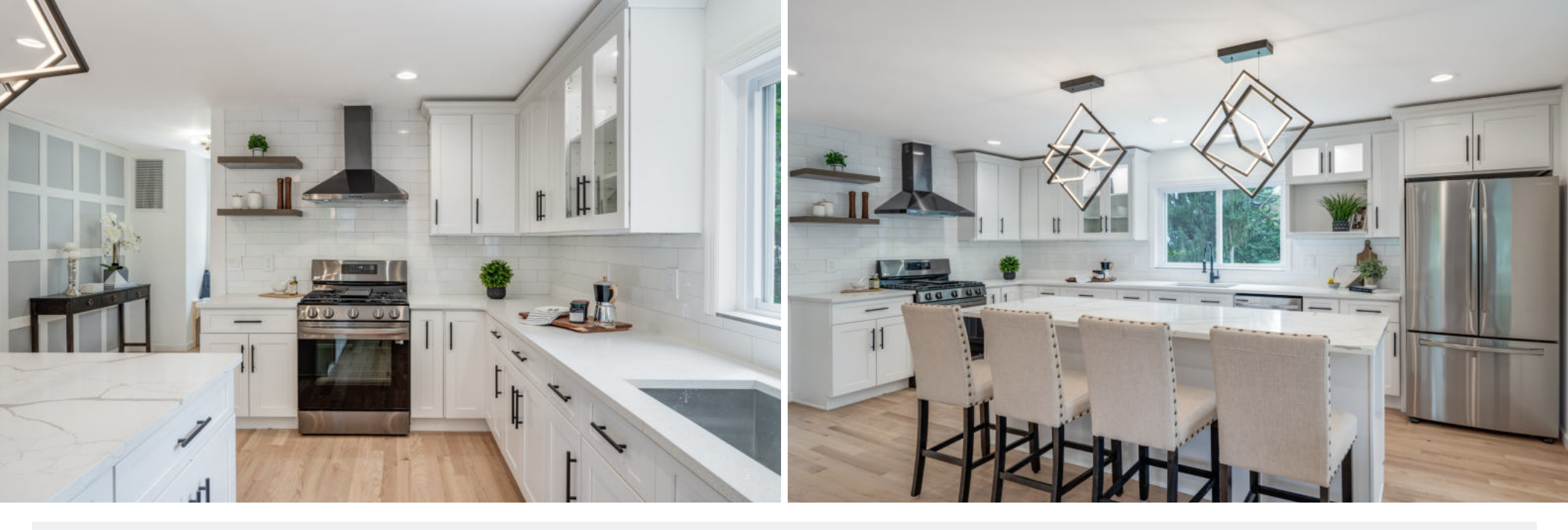
The Gourmet Chef's Kitchen is outstanding with superb design and finishes. Sleek white cabinetry, quartz countertops, stainless steel appliances and an exquisite island with seating for 4 are just a few of the outstanding features of this room. Two dazzling light fixtures above the island only add to the sophistication of this space. Down the hall, don't miss the Bedroom 4/Office, and a beautiful Renovated Full Hall Bathroom with chic tile and designer details.