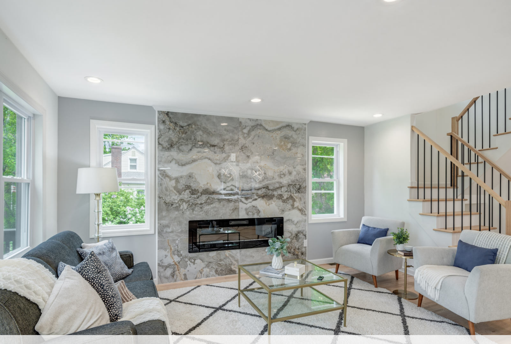
Breathtaking Brand New Construction (on expanded original foundation) in the heart of Chatham Township close to downtown shopping/restaurants, New York City train, top-notch schools, and parks and recreation! With 5 gracious bedrooms, 4 Full Baths, a seamless open concept floor plan and completely on-trend designer touches throughout, 2 Cedar Lane is a dream home in every way.