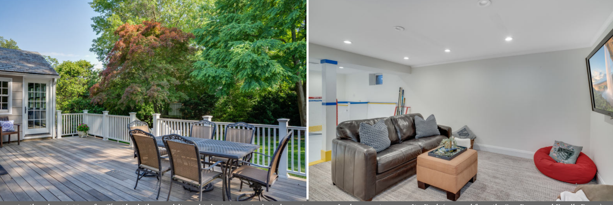
Another show stopper of 41 Templar is the exquisite and private property, just above 1/3 an acre. Lush green spaces, an Ipe Deck (accessed from the Sun Room and Family Room) and abundant privacy plantings radiate absolute serenity.

And there's more ... The Lower Level, with a fantastic Recreation Room/Exercise Room will provide endless hours of family entertainment. The Lower Level also includes your own synthetic Mini Hockey Rink/Sport/Multi-Purpose Area ensuring your house will be the spot for all playdates! A Full Bath, 2 Closets and a large Utility/Storage Room with tons of storage round out the Lower Level.