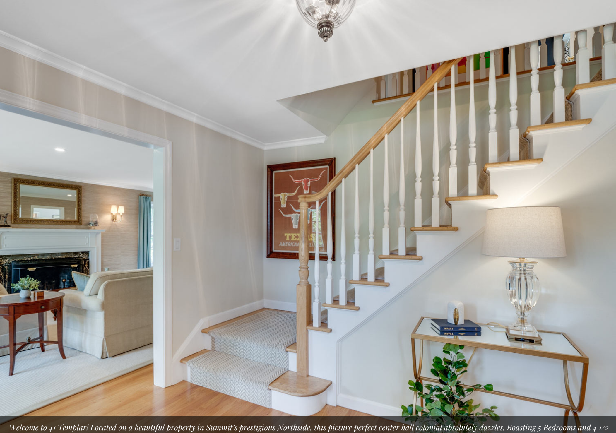
Welcome to 41 Templar! Located on a beautiful property in Summit's prestigious Northside, this picture perfect center hall colonial absolutely dazzles. Boasting 5 Bedrooms and 4 1/2 Baths, this home includes an open and airy floorplan and plenty of space for everyday living and entertaining. Close to Midtown Direct Train, Route 24, Reeves-Reed Arboretum, Beacon Hill Club, excellent restaurants, shopping and Summit's top-notch schools (Lincoln-Hubbard Elementary), this home wows at every turn!