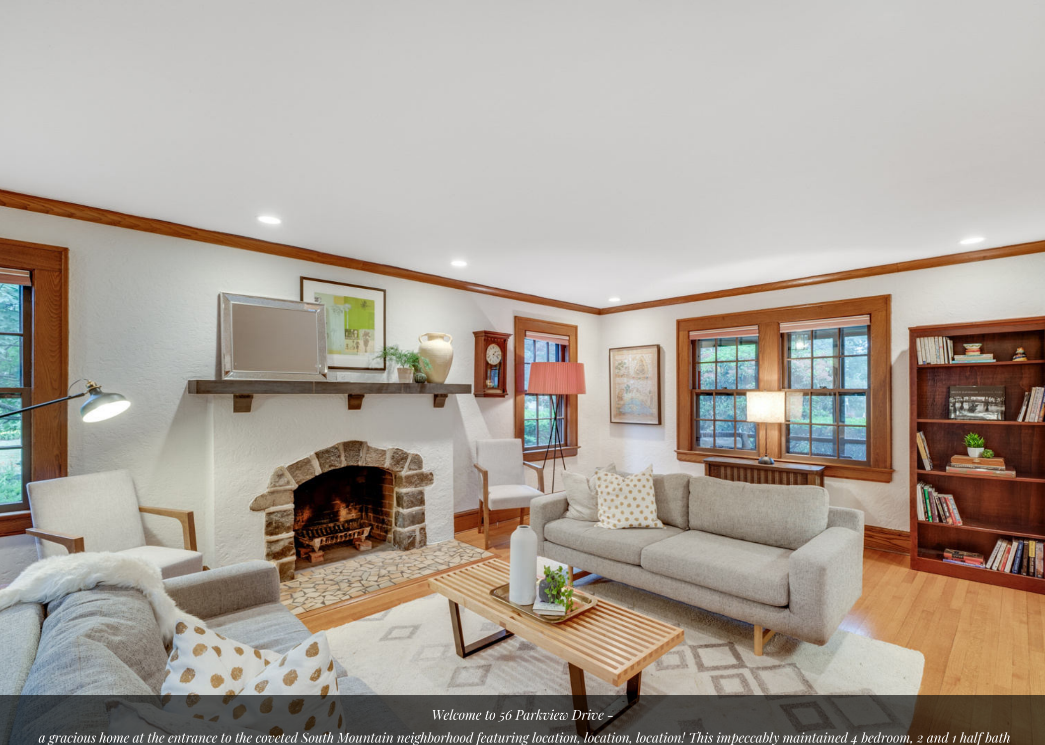
a gracious home at the entrance to the coveted South Mountain neighborhood featuring location, location, location! This impeccably maintained 4 bedroom, 2 and 1 half bath classic and updated Tudor is magical in every way. Sited on a spacious corner lot, it features incredible architectural details and Taylor Park at your doorstep.