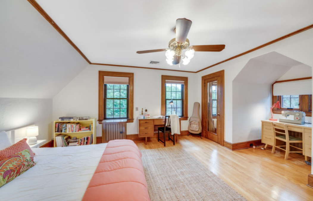
Back inside, the 2nd floor features 3 bedrooms and an office. The spacious and sunny primary bedroom suite boasts privacy, hardwood floors, a walk-in closet and a tasteful ensuite bath. Two additional light-filled bedrooms, each with hardwood floors and large closets offer abundant living space. The office/sitting room off bedroom 3 could alternatively be used to expand the primary bedroom. The roomy full hallway bath is well-appointed with stylish tile and a chic vanity. On the third level you'll find a bright and spacious 4th bedroom with a vaulted ceiling and custom built-ins, as well as a panoramic view of Taylor Park.