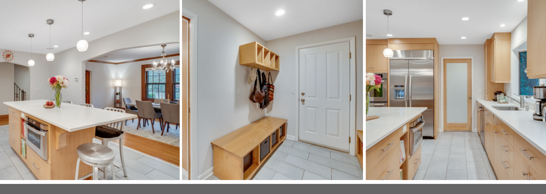
Prepare to be dazzled by the gourmet chef's kitchen with sleek wood cabinetry, an enormous island, Silestone countertops, and high-end stainless appliances. Radiant heat completes the functional and comfortable space. A well-designed mud room and a 1 car garage (with another half bay for storage) round out this level. Outside, enjoy the flat, private, partially fenced property that exudes rest and relaxation.