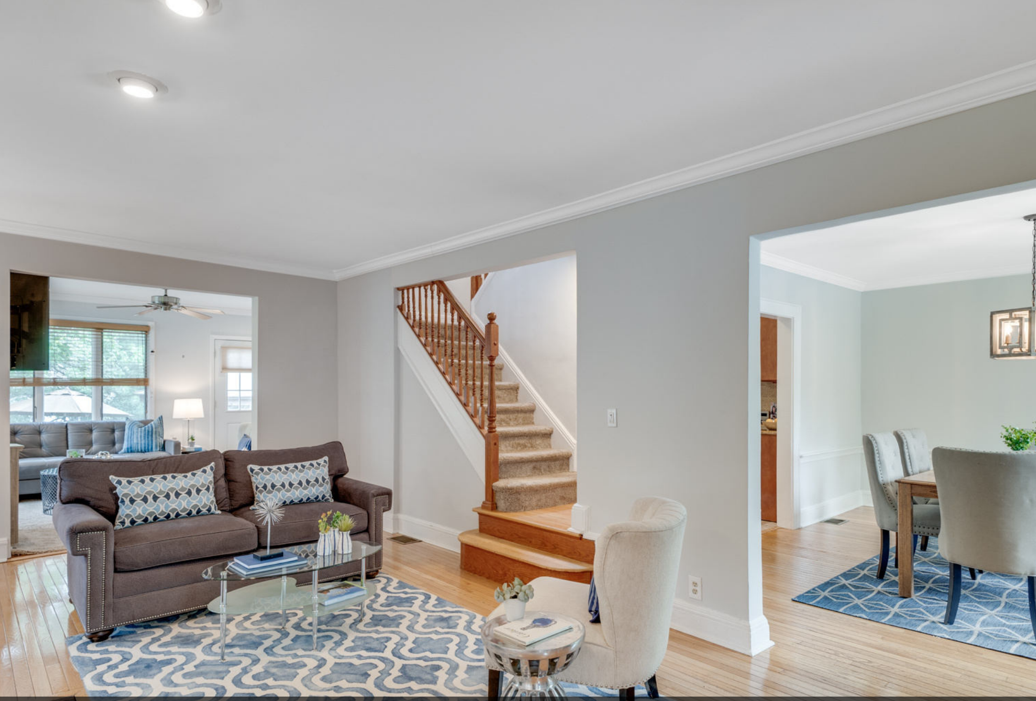
Welcome to 7 Milton Avenue! This picture perfect 4 Bedroom, 2 Full and 2 Half Bath gem in sought-after Florham Park has it all with close proximity to Florham Park shopping (Kings, Trader Joes, Starbucks), top-notch schools, and Chatham/Madison restaurants/shopping/Midtown Direct Train. With 3 NEW Baths, outstanding property, and a flexible floorplan, this home checks each and every box.