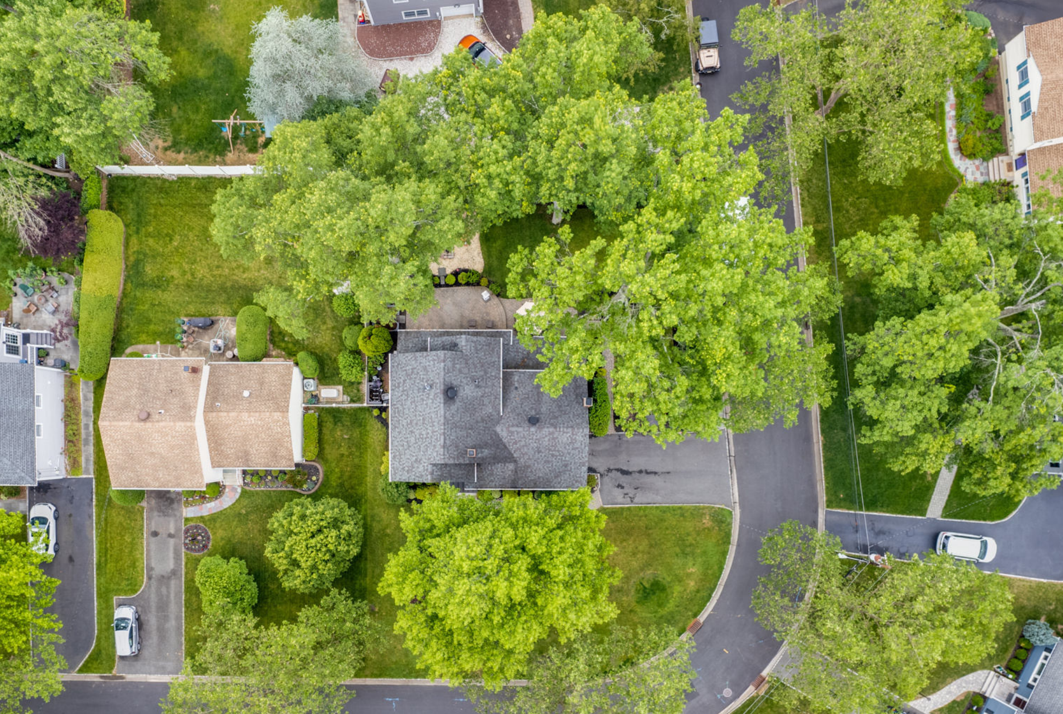
Welcome to 73 Dogwood Lane! This custom built 4 Bedroom, 3 Full Bath home boasts an open and airy floor plan with tasteful finishes, a spacious corner lot and delightful backyard. Just a few blocks to the elementary, middle and high schools and close proximity to New Providence's vibrant downtown area and easy access to Route 78 and New York City Train, this home checks each and every box.