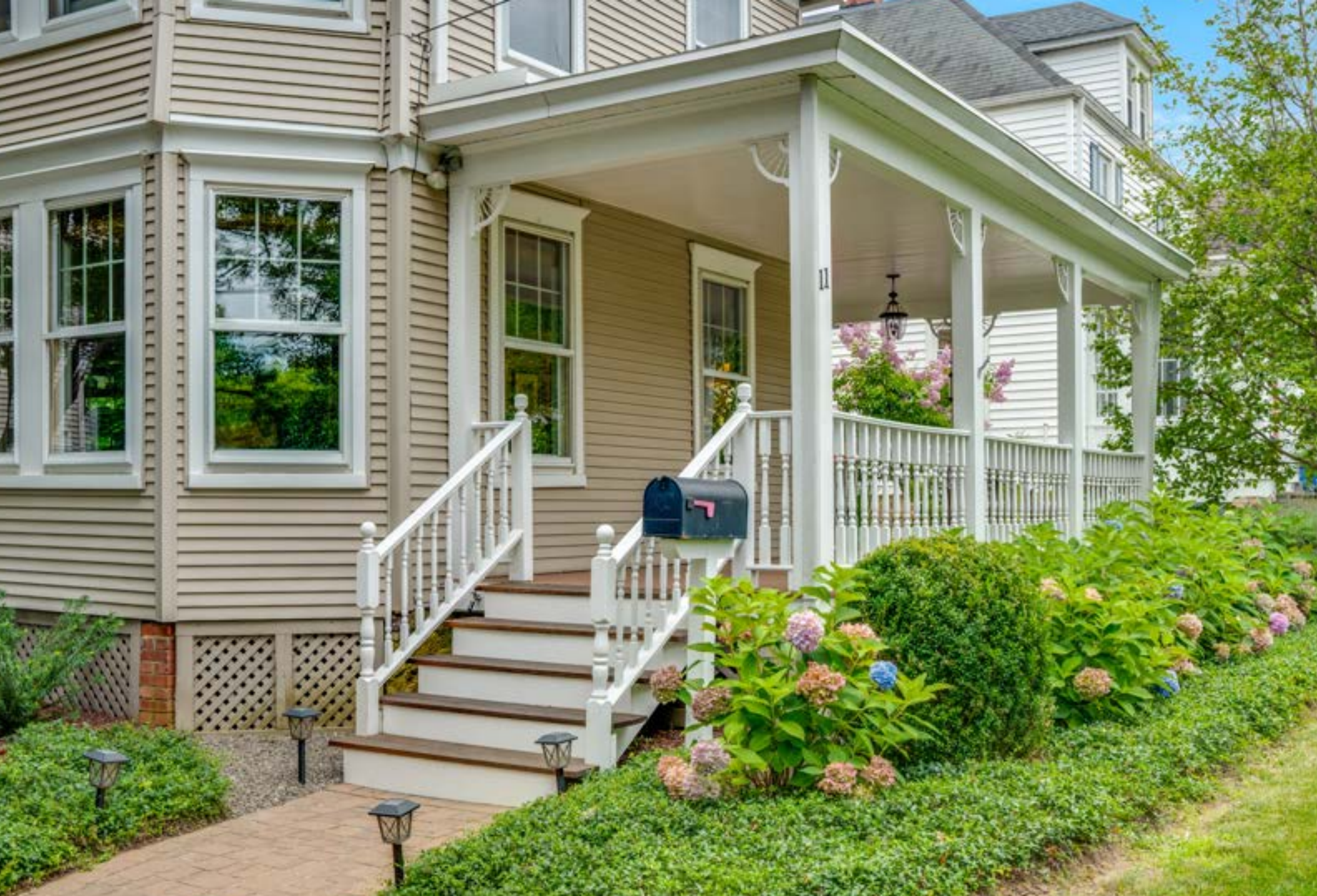
Introducing 11 Dobbs Street in sought after Bernardsville! This 4 Bedroom, 3.1 Bath absolutely darling home checks so many boxes with a charming Front Porch, period details, a fabulous floor plan, and a beautiful backyard. Minutes to Route 202/287, restaurants/shopping, top-notch schools, New York City train, parks/recreation and country clubs, don't miss this incredible home.