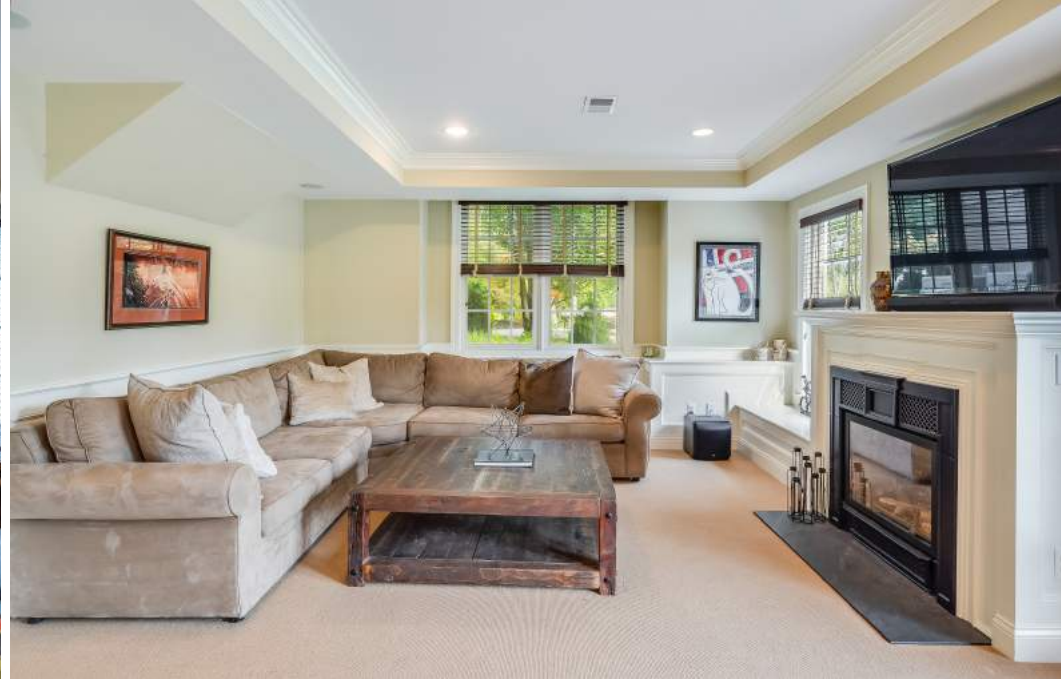
There's more! The "walk out" Lower Level, with a fabulous Wet Bar, Recreation Room (with 2 distinct areas for Billiards/Games and TV watching) with a fireplace, an Exercise Room, a Full Bath, and tons of storage is a homeowner's dream. Whether it's movie watching, card games, children's art projects, or exercising the Lower Level provides wonderful functional space.