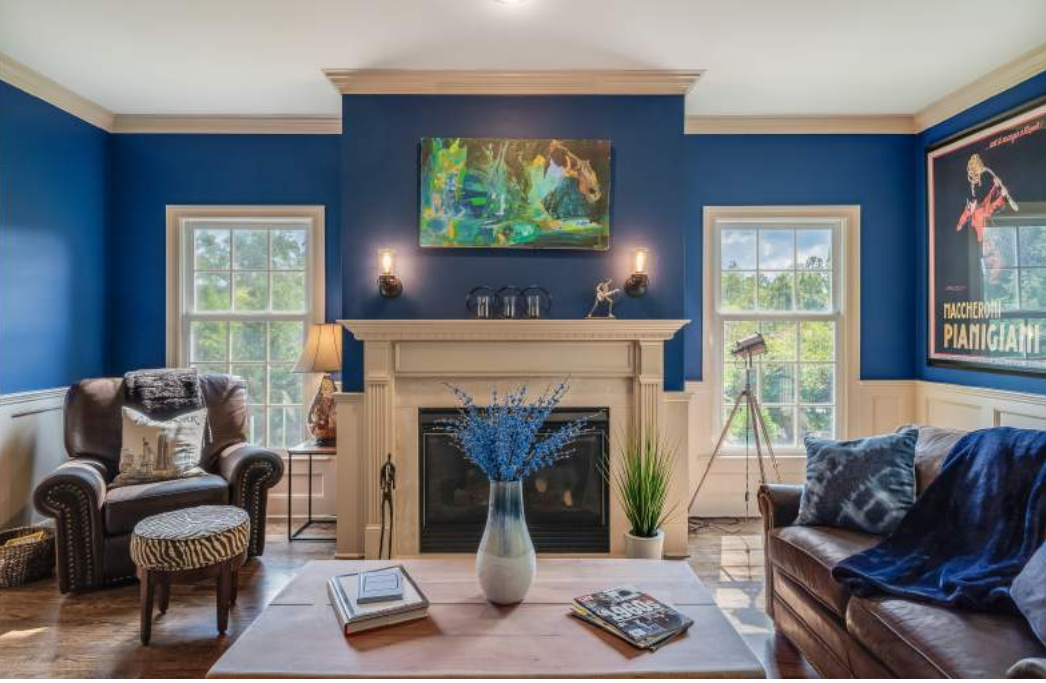
Enter the spacious and elegant 2-story Entry Foyer and prepare to be overwhelmed by the sheer elegance, light, and scale of this home. The Entry Foyer includes soaring ceilings, two Coat Closets, and gorgeous views of both the Living and Dining Rooms beyond. Gleaming hardwood floors, incredibly high ceilings, striking light fixtures, and exquisite millwork carry through the entire home. Fantastic flow and gracious rooms make this the ideal home for family gatherings and entertaining. From the Foyer, enter into the Living Room where you can curl up with a book by the fireplace. Mix a cocktail in the fabulous Wet Bar with tons of custom cabinetry and wine/beverage refrigerators. Flow easily into the well-designed Office featuring custom built-ins with tons of open and concealed storage so that working from home is a pleasure.