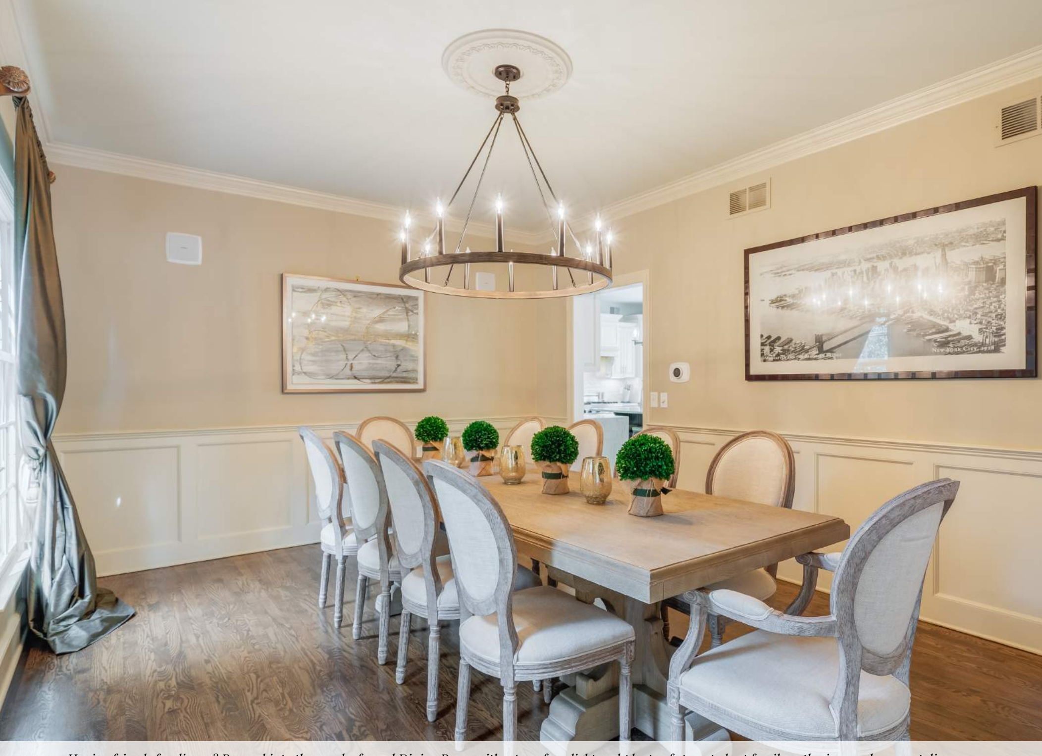
Having friends for dinner? Proceed into the nearby formal Dining Room with a ton of sunlight and plenty of space to host family gatherings and gourmet dinners.