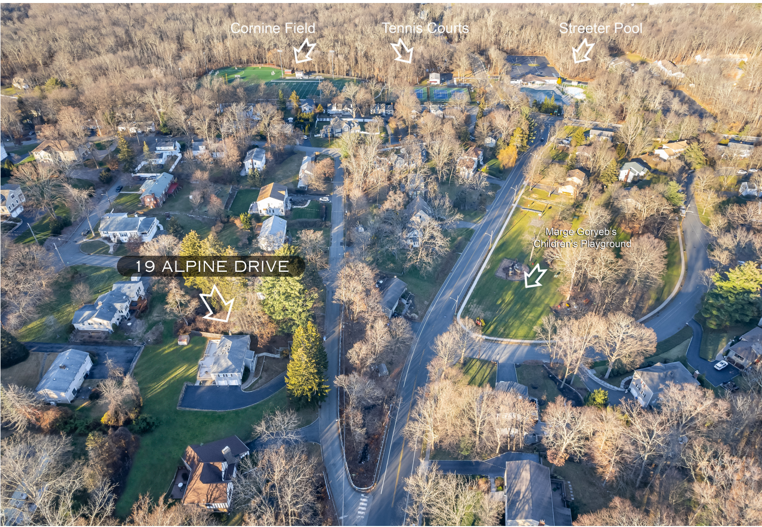
Great Morris Township location close to NYC transportation, downtown Morristown restaurants, shopping, destination-worthy park land, Streeter Pool, and top-rated schools!

Beautiful Split Level home with a fantastic floor plan, sprawling Deck, and close-to-everything location. Sun-drenched Living Room with gleaming hardwood floors and oversized windows overlooking nature. First-floor Primary Suite with a spa-like Bath. Spacious Bedrooms 2 and 3 with large closets. Lower Level with a Family Room, Full Bath, and Bedroom 4 can easily be used as a Guest or Au Pair Suite. Offering proximity to both sought-after Morristown and serene open spaces, 19 Alpine won't last!