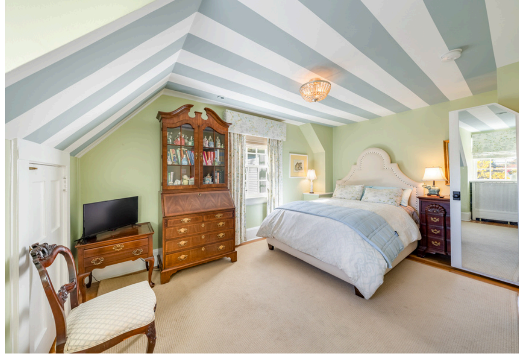
Primary Bedroom with massive Walk-In-Closet, chic En-Suite Bathroom, 4 Bedrooms in 2 Wings, 2 Hall Full Baths, a sitting "Lobby," and sunken Home Office through arched doorway in 5th Bedroom holds all the charm on 2nd Level!